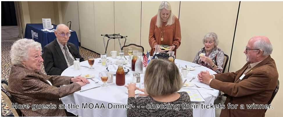
More guests at the MOAA Dinner --- checking their tickets for a winner.