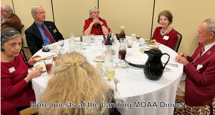
More guests at the Landing MOAA Dinner.