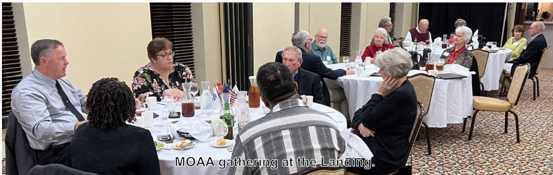
MOAA gathering at the Landing.