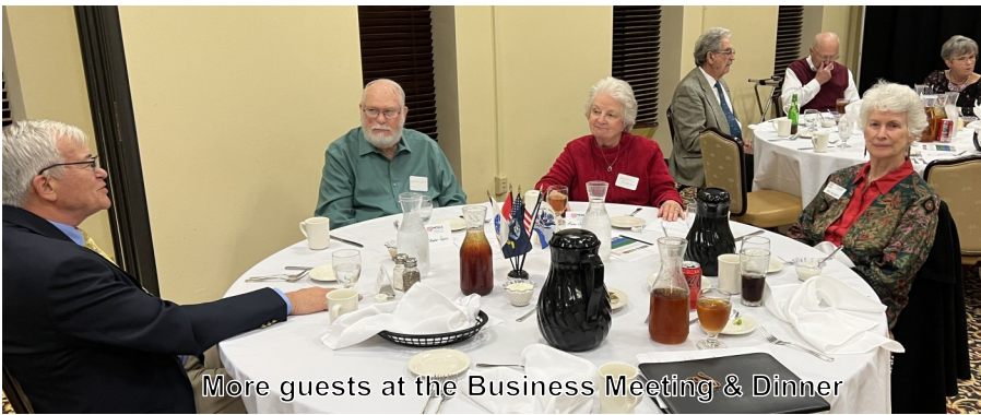
More guests at the Business Meeting & Dinner